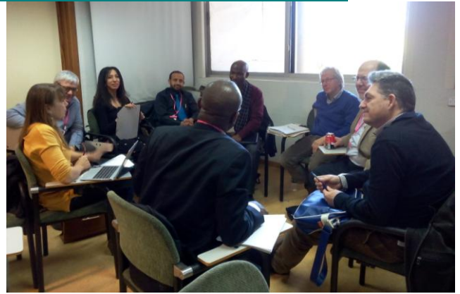
One of the pre-symposium Working groups in French

A Global pre-symposium brought together representatives of national and regional associations and organizations that were mostly IAEVG members.