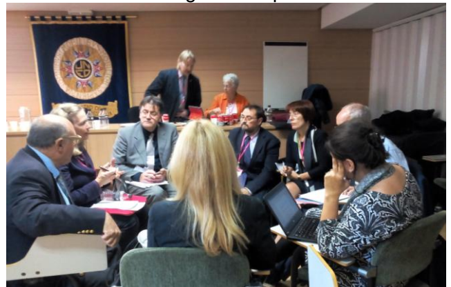
One of the pre-symposium Working groups In English

The symposium promoted one of IAEVG's major missions: to facilitate and improve communication among members and organizations in the field of educational and vocational guidance, but also to encourage the development of ideas, practices and research and collect and disseminate information on the latest research and guidance practices.