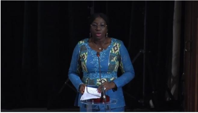
Ms Kandia Camara Minister of National Education of Côte d'Ivoire In her speech at the conclusion of the conference

Her address was directly related to the theme of the conference, the contribution of guidance for greater equity in education and in promoting and effect transition from education to working life..