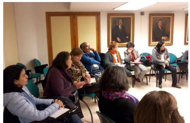
One of the pre-symposium working groups in Spanish

a critical mass to support the advancement of career development in our countries and regions